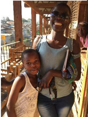
Survivor with her daughter

school nearby was nearing completion, funded and supervised by an Italian architect and his group. As my guide said, keeping girls in school is the most effective way to protect girls from violence, FGM, early child marriage and teenage pregnancy. Rescue centres should also be supported and equipped to salvage out-of-school girls. MWIA is well-placed to raise awareness, and advocate for change at Government and community levels.