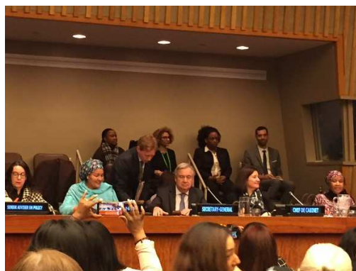
Antonio Guterres and Exec Director UN Women, Phumzile Mlambo-Ngcuka (far right)