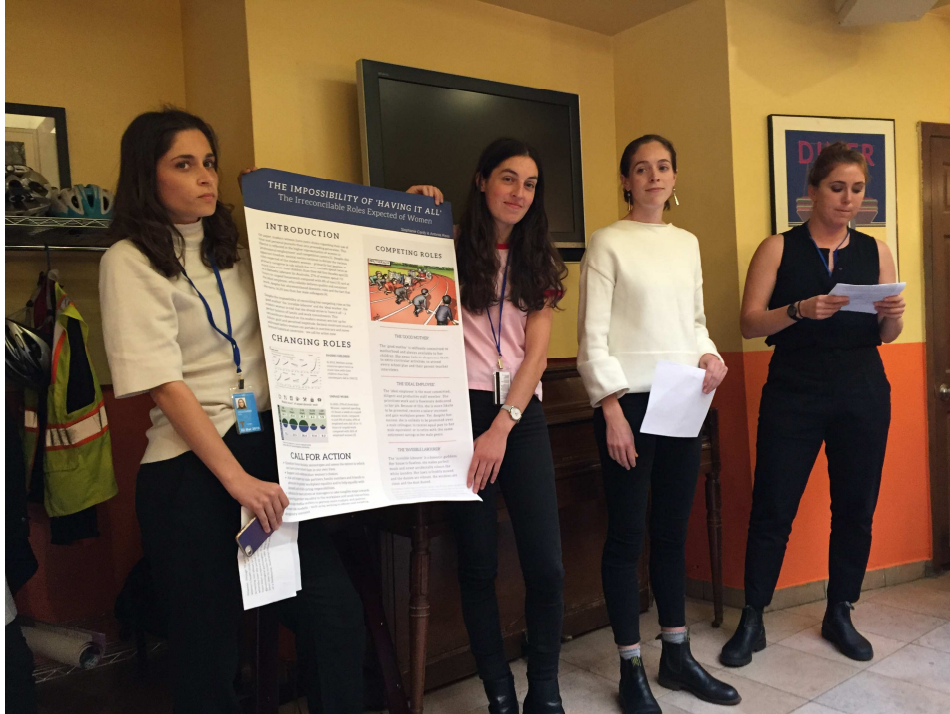
The Medical Women’s Association of Nigeria had a parallel event as well that was held on Friday, March 15 th . The title of their event was “Social and Economic Consequences of Teenage Pregnancy: Enhancing Our Social and Economic System.”